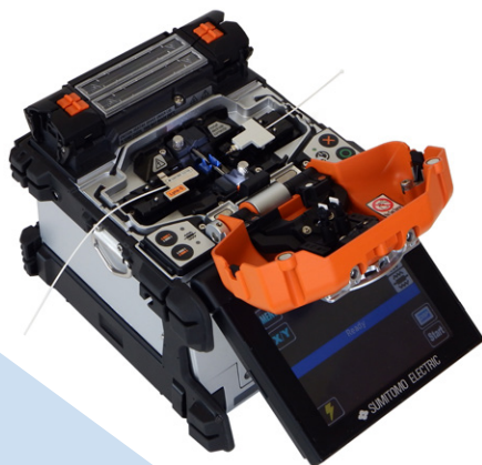
Shown with Optional Lynx2 CustomFit® Splice-On Connector