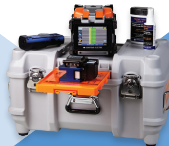
Quantum Transit Case as Work Surface