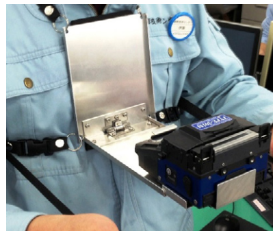
Quantum Type-QH201e-VS Shown with Optional Work Harness