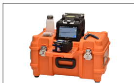
Carrying case with worktable CC-82