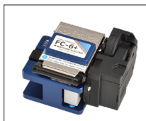
Table-top cleaver FC-6+ series