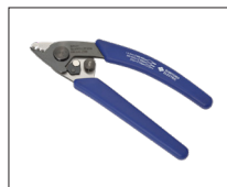
Jacket remover JR-M03